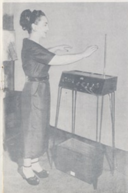
This is the position the performer assumes when playing the Theremin. Notice that the performer is not in physical contact with any part of the instrument.

These are the only movements involved in playing the instrument. As with all instruments, some practice is necessary to achieve a proper technique. If the prospective player has had any musical experience, or is musically inclined, the fundamentals of Theremin playing may be quickly mastered. Once the fundamentals have been learned, the player will find it easy to develop techniques and effects to suit his needs.