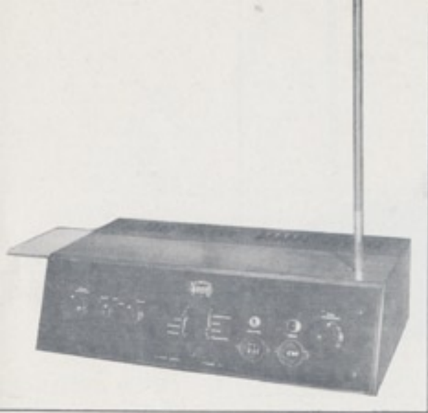
The model 351 Theremin

The model 351 is basically identical with model 305. However in the model 351 two features have been added which greatly expand the versatility of the instrument.